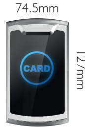
Wall mounted reader